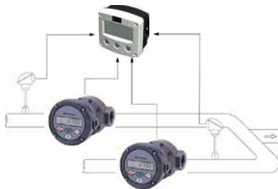
A typical fuel consumption setup.